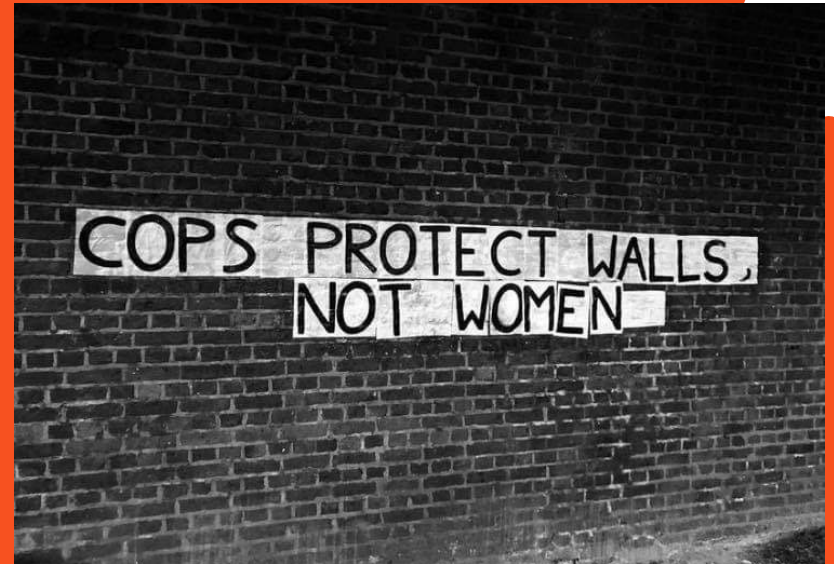
The Feminist London Collage slogan 2021