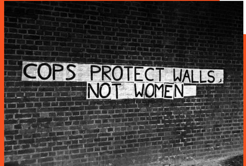
The Feminist London Collage slogan 2021