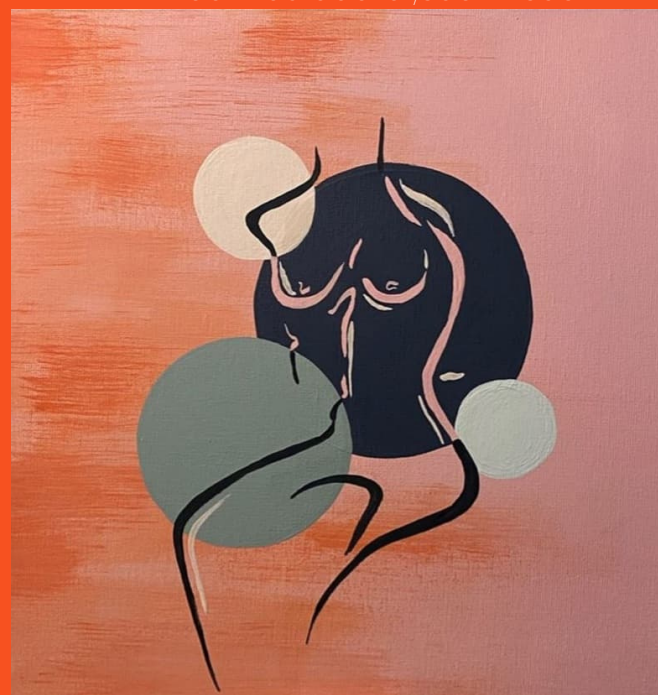
Orange and Pink Lady, emulsion on canvas bord 30cmx30cm