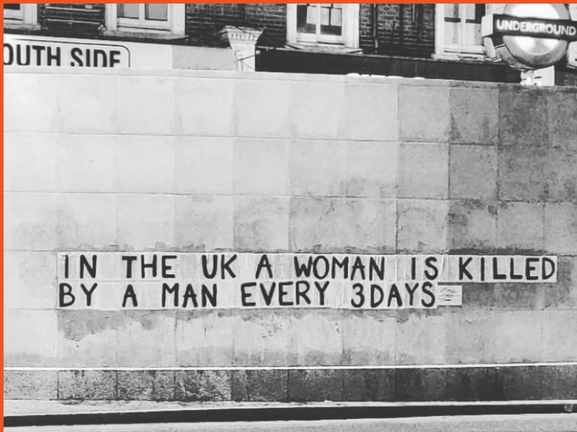
The Feminist London Collage slogan 2021