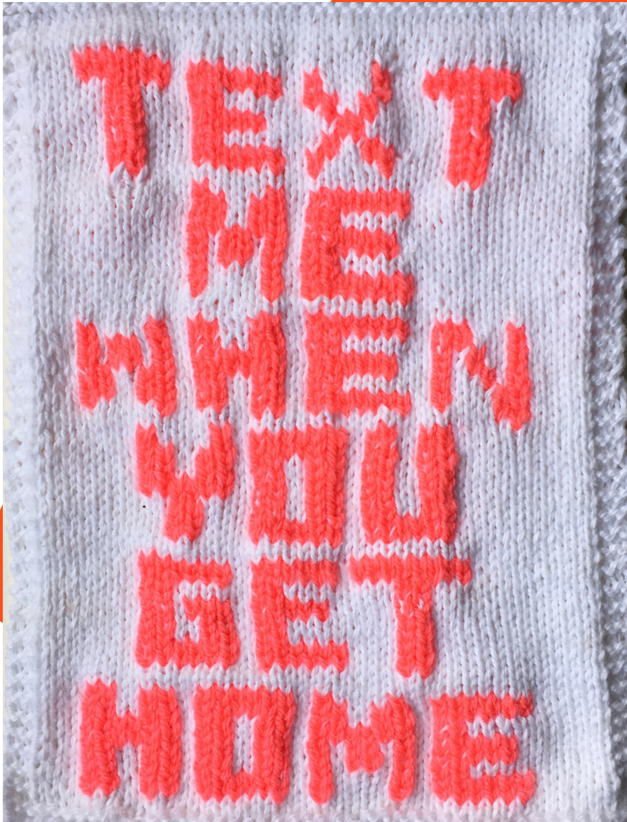
"TEXT ME WHEN YOU GET HOME hand knitted (2021)

"TEXT ME WHEN YOU GET HOME (2021) was conceptualised as a piece to commemorate the bond shared between those vulnerable to the night and the friends that keep them safe. The process of hand knitting is fairly slow, and over the couple of weeks that I was spending on the piece, Sarah Everard became increasingly prevalent across the news and instagram feeds. What was initially a light-hearted memory of nights out past had now become a stark reminder of the wicked reality for so many. Violence against ethnic minorities, women, and LGBTQ+ people is often cloaked by the night, the curfew for anyone vulnerable being 5PM during the winter. Even when home safely, the time spent wondering how many ways you can be harmed on a ten-minute walk home from a friend's house is traumatic enough. I am proud to protect my friends and have my friends protect me, but what we need are effective provisions to keep people safe, and actual follow-up on cases of sexual assault- and to not have to rely solely on an Instagram infographic showing six different ways to twist an arm that has grabbed you from behind"