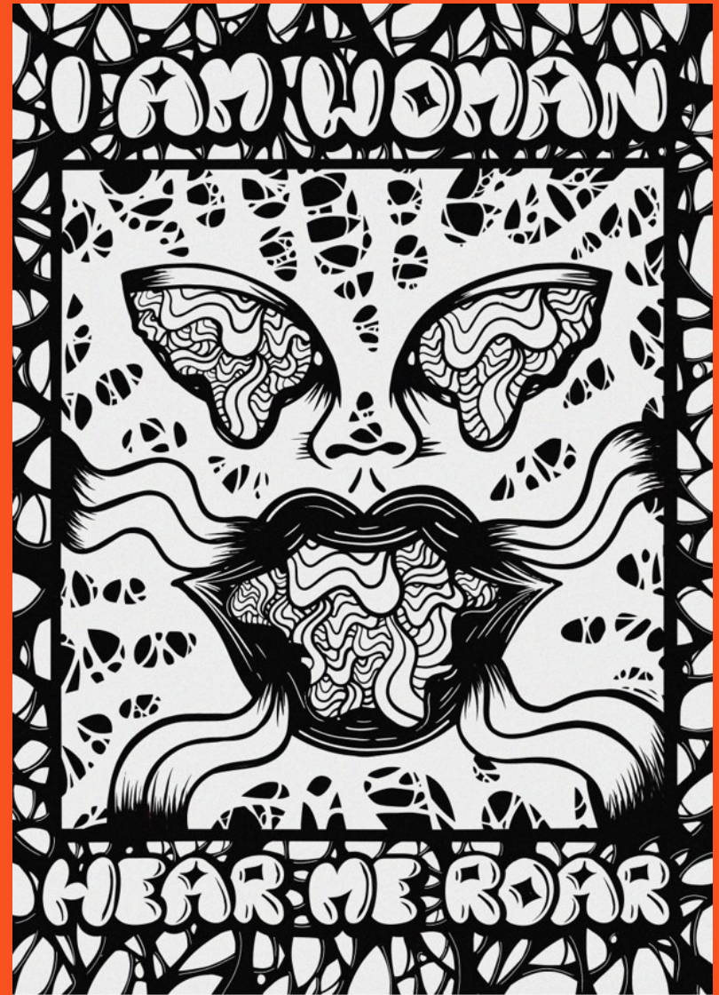
I AM WOMAN , digital print 2021

They believe it is important to allow ideas and new skills to flow with the Smogg, that way life is more exciting.