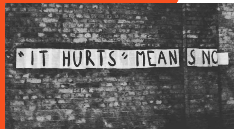
The Feminist London Collage slogans 2021