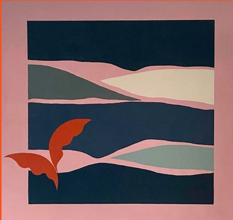
Pink and Blue Sussex' Downs, emulsion canvas, 1m x 1m

How these figures interact with each other and the other shapes within the artwork provides a commentary on the artist's position within society: being the only person of colour on their university course, the position in mostly white friendship groups, and the position going forward in the art world. The artist's ongoing questioning of belonging and nature underlies all aspects of their own practice.