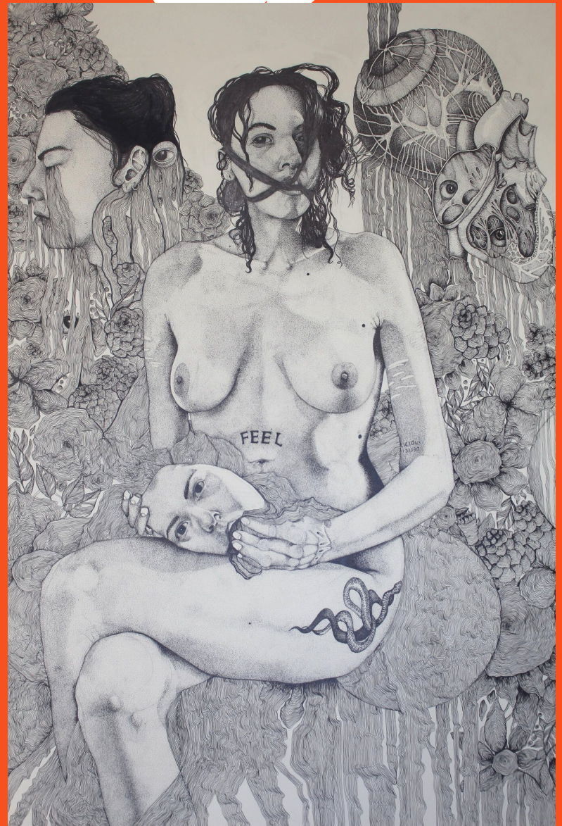
Self-portrait, dot technique using pen on AI cartridge paper, 2021

Quote from Petya TOMOVA's interview 2021