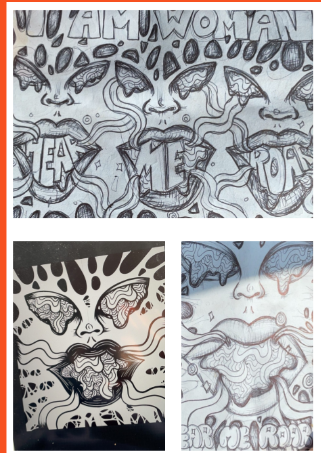
Artist's initial drawings of the work I AM WOMAN 2021